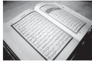
The Qur’an was written down in the seventh century A.D. and claims to be the final and authoritative word of God, having superseded all previous revelations.

4. The Qur’an has many internal inconsistencies. Here are just a couple of examples. Sura 21:76 says that Noah and his family survived the flood, but sura 11:42-43 states that one of Noah’s sons drowned. Sura 28:40 says that Pharaoh, who pursued Moses and the Israelites drowned (also see 17:103, 43:55), but sura 10:90-92 says that Pharaoh survived.