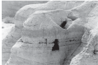
Hundreds of ancient Biblical manuscripts found in the caves of Qumran by the Dead Sea between 1947 and 1956 have further confirmed the fact that the text of the Bible has not seen corruption.

Another evidence that the Bible has not seen corruption are the writings of the Church Fathers (men like Polycarp, Justin Martyr, and Tertullian, who were leaders in the early Christian church during the first and second century A.D.). In their writings, they quoted the New Testament alone 86,000 times! In fact, they referred to it so often and so thoroughly that textual critics can reconstruct the entire New Testament (except eleven verses) from their quotes.